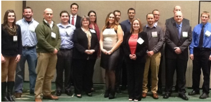
New licensees gather for group photo after the ceremony in Charlotte on January 24.